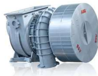
ABB , IHI , MITSUBISHI , NAPIER , MAN B&W , KBB , NIIGATA , GARRETT